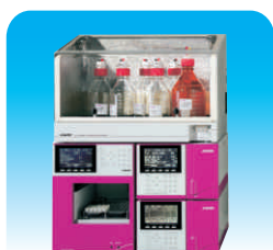
Amino Acid Analyzer