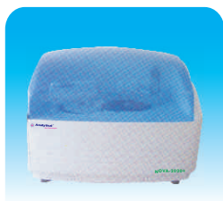
NOVA 2020 Plus Automatic Bio-Chemistry Analyzer