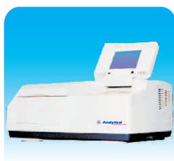
UV - Vis Spectrometers