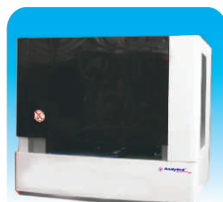
Fully-automated Coagulation Analyzer