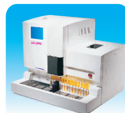
URINOVA 2800 Urine Analyzer