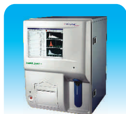
HEMA 2062 Plus Fully-automatic Hematology Analyzer