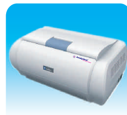
RT PCR / PCR