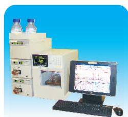
Intelligent HPLC / UFLC / UPLC / nanoLC™