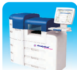
Fully Automated CLIA