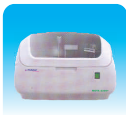
NOVA 2200 Plus Auto Chemistry Analyzer