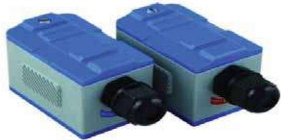
Clamp On Ultrasonic Flow Sensor