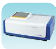
UV/VIS Spectro 2080+ Double Beam

Analytical Technologies is synonymous for offering technologies for doing analysis and is the Fastest Growing Global Brand having presence in at least 96 countries across the global. Analytical Technologies Limited is an ISO:9001 Certified Company engaged in Designing, Manufacturing, Marketing & providing Services for the Analytical, Chromatography, Spectroscopy, Bio Technology, Bio Medical, Clinical Diagnostics, Material Science & General Laboratory Instrumentation. Analytical Technologies, India has across the Country operations with at least 4 Regional Offices, 6 Branch Offices & Service Centers. Distributors & Channel partners worldwide.