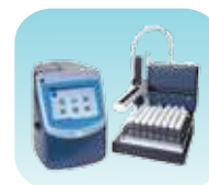
Total Organic Carbon 3800