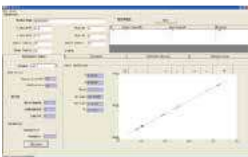
Working curve for Carbon