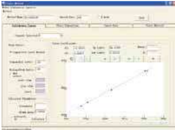
Working curve for oxygen