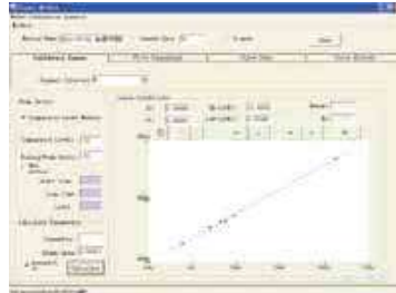
Working curve for nitrogen