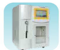
Liquid Particle Counter