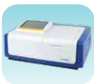
UV/VIS Spectro 2080+ Double Beam