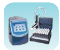
Total Organic Carbon 3800