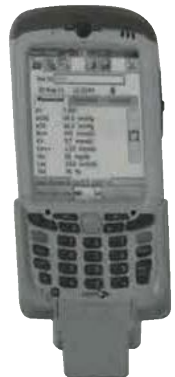
epoc® Host 2