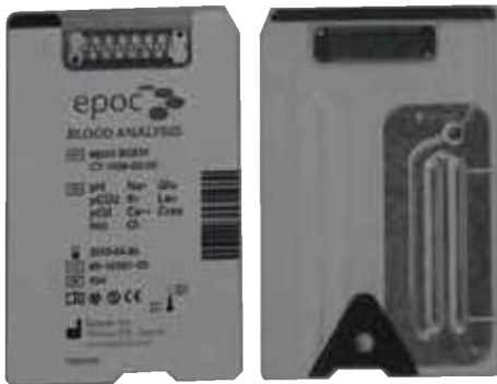
epoc® BGEM Test Card

The Enterprise Point of care (epoc) blood Analysis System is the only wireless bedside testing solution to use "Smartcard" technology. This next generation technology provides patient results directly to a PDA and to the EMR, allowing the clinician to stay at the patient's side,