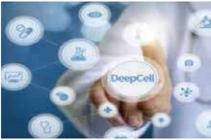
AI DeepCell engine