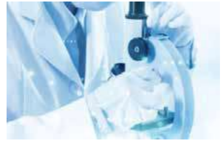
Multi-layer dynamic focus scanning