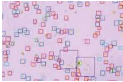
Formed elements recognition technology of mixed intelligent perception and convolutional neural network