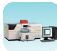
Atomic Absorption Spectrophotometer