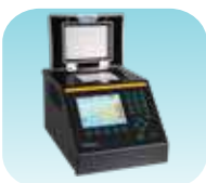
PCR/Gradient PCR/ RTPCR