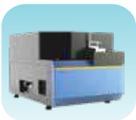
Optical Emission Spectrophotometer