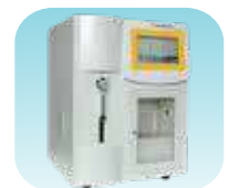
Liquid Particle Counter