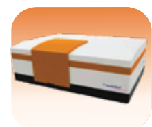
Benchtop FTIR 3890