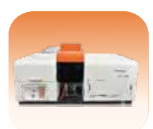
AAS - 2800