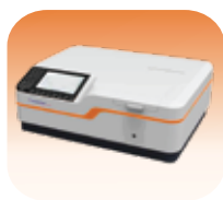
X-Series UV-VIS 3080