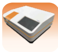
UV-Vis Spectrophotometer with PMT T-Series