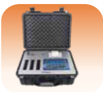
Multi-Function Food Safety Rapid Detector FSD3180