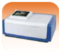
UV/VIS Spectro 2080+ Double Beam