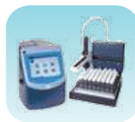
Total Organic Carbon 3800