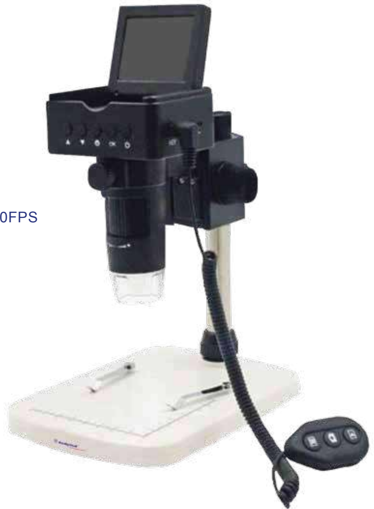
LDM-3155 2.4' LCD Digital Microscope, 220x, 3.0M