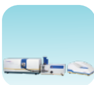
Laser Particle Size Analyzer