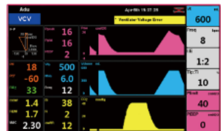
8" Screen display

Fresh gas, compliance and leakage compensation VCV, PCV, PSV, SIMV, ACGO, Manual ventilation modes Alarms of incorrect installation of breathing system and soda lime canister.