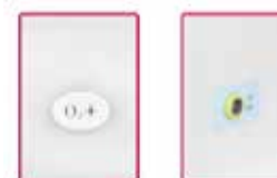
Flush O 2