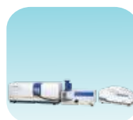
Laser Particle Size Analyzer